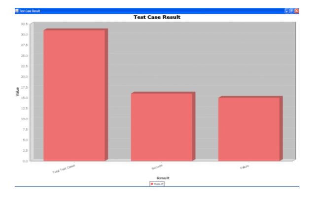
Table: 4.6 Result generate